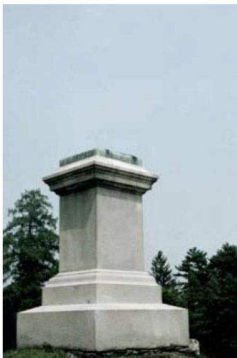
Peggy Buth, Found Footage (Monument), C-Print, 2007