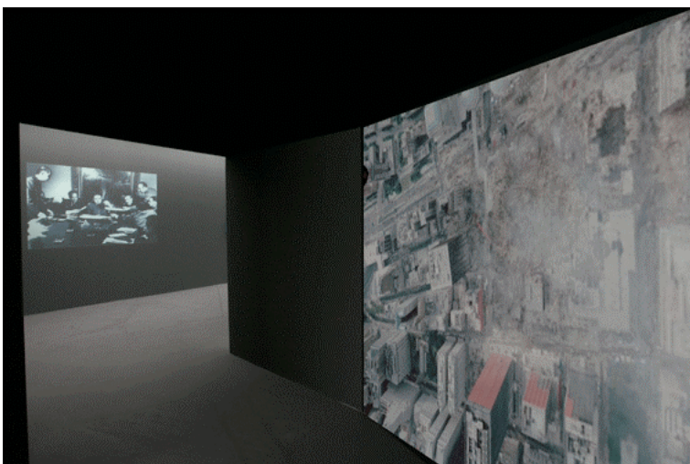
Exhibition views, Württembergischer Kunstverein, 2008