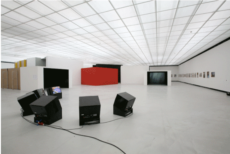
Exhibition view at Württembergischer Kunstverein Stuttgart (Archive), 2008

Postcapital , first shown in 2006 at the art institution La Virreina in Barcelona, is presented in a different way at each exhibition space it graces. In Stuttgart, the presentation consists of an ensemble of accessible exhibition modules portraying the outside view of an “urban silhouette” shifted from the center. The video montages, images, and documents which can be seen inside are all based on Andújar’s digital archive and are focused on various contextual aspects.