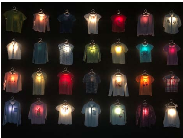
Exhibition view WKV 2023 (Excerpt)

The installation consists of 44 used children's shirts of different colors, hung one below the other in four rows, each illuminated from behind. The colorful luminous splendor of the installation from children's clothes is contrasted by the photograph opposite. It shows the back of a child with notes written on it. Ukrainian parents inscribe the backs of their children with contact details of relatives, in case they themselves die and their children survive.