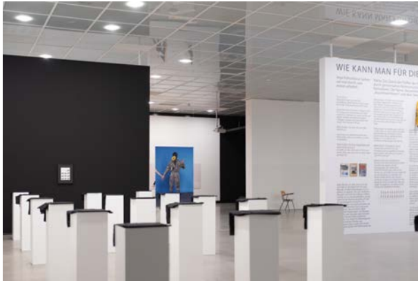
Exhibition view WKV 2023