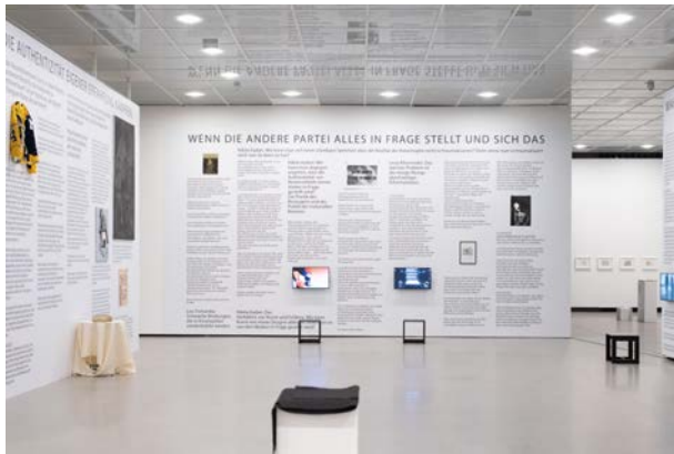
Exhibition view WKV 2023