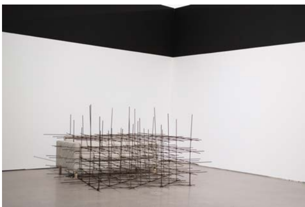
Exhibition view WKV 2023

The starting point for this installation is the image of a bombed-out apartment building in Ukraine. It stands for the daily violent penetration of war into the sphere of the private, familiar, and protective. The architect and artist Bogdan Tomashevsky translated it in the form of an installation with a sofa pierced by reinforcing bars. The skeleton of a concrete building, which reappears only when it is destroyed, violates the comfort zone. It turns from the supporting element of the sheltering home into a weapon against the same.