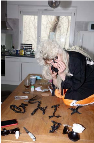
It's Not Your Problem, 2022 Neon sign