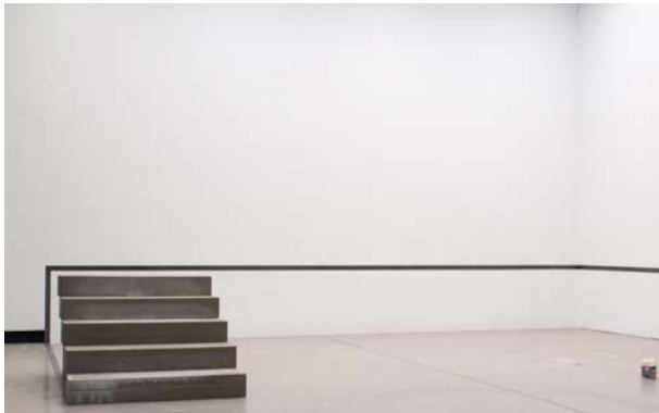
Exhibition view WKV 2023

Installation with concrete stair treads, metal strips on wall, a floor drawing, and a photograph